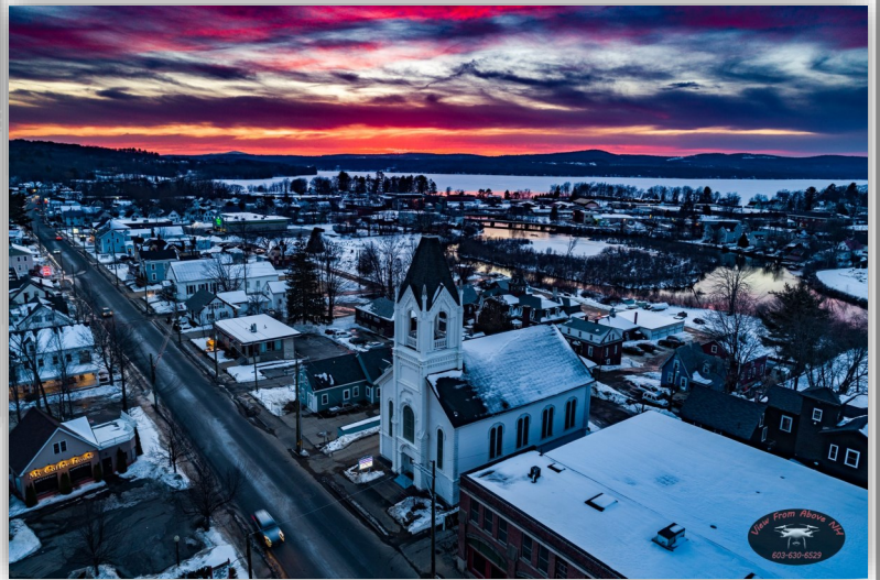
Overhead sunset view looking down Court Street.

On January 14, 2021 Governor Sununu announced that the Phase 1B vaccination plan is adjusted to include any individuals 65 and older.